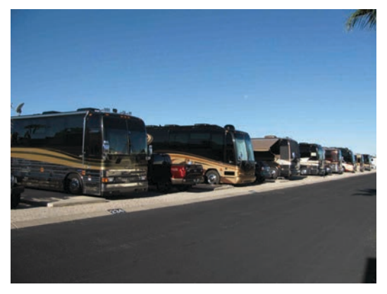
On Tuesday, the club visited Sabino Canyon and Saguaro National Park. Then they enjoyed a scrumptious buffet meal at the Tanque Verde Guest Ranch.