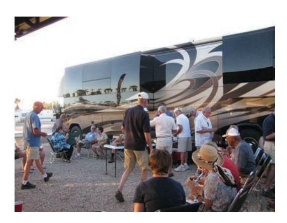
Coach, our sponsor, hosted a welcoming reception that was followed by the Pueblo High School Mariachi band. The kids serenaded us and even danced with us. Great fun for all!